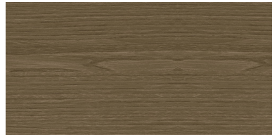
COD. 26 OLMO MODERNO | MODERN ELM ▲