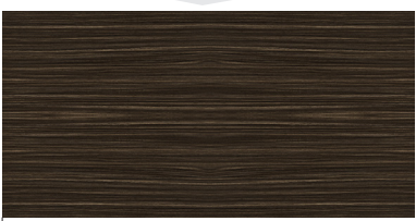
COD. 63 PIOPPO MORO | DARK POPLAR ○