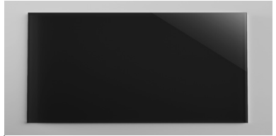
COD. 10 NERO | BLACK □