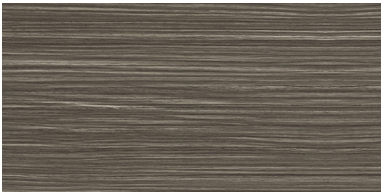
COD. 64 PIOPPO LIGHT | LIGHT POPLAR ○