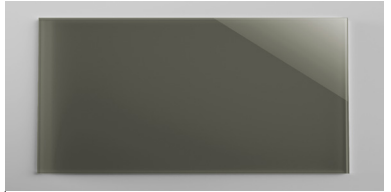
COD. 71 GRIGIO LONDRA | LONDON GREY □