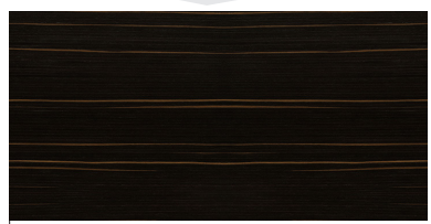
COD. 25 EBANO CLASSICO | CLASSIC EBONY ▲